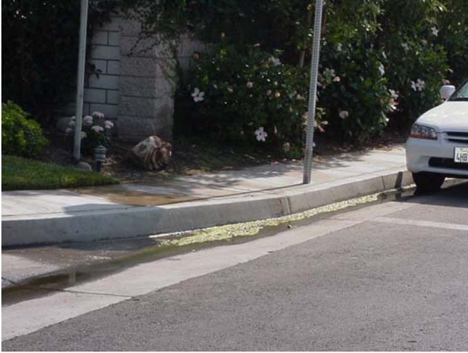
Unightly algae and potential liability.