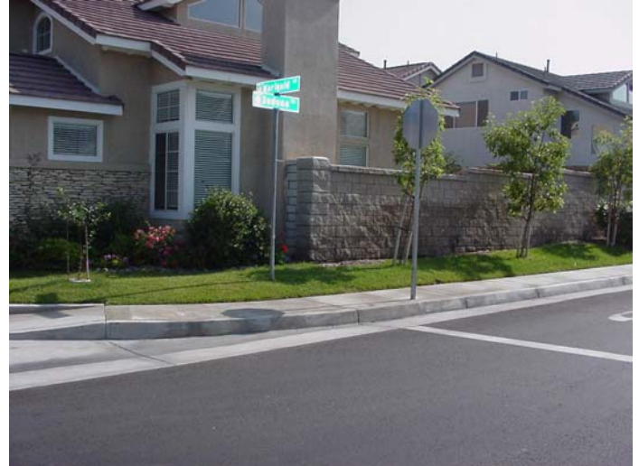
Sparkling clean, great curb appeal!

Pictured are two intersections of the same street about 200 feet apart (pictures taken same day)